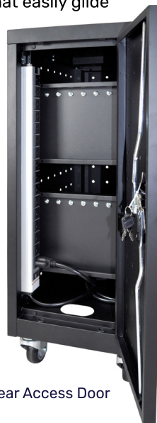
Rear Access Door